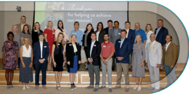
HHF Board of Trustees

AS THE WORLD works its way out of the worst health care crisis of the century, we have continued to fundraise for the frontlines, provide innovative equipment and technology for our hospitals, and improve patient lives. Thank you for joining us in this meaningful work.